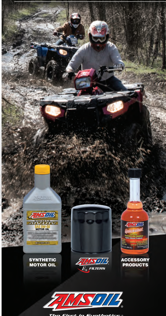
SYNTHETIC MOTOR OIL