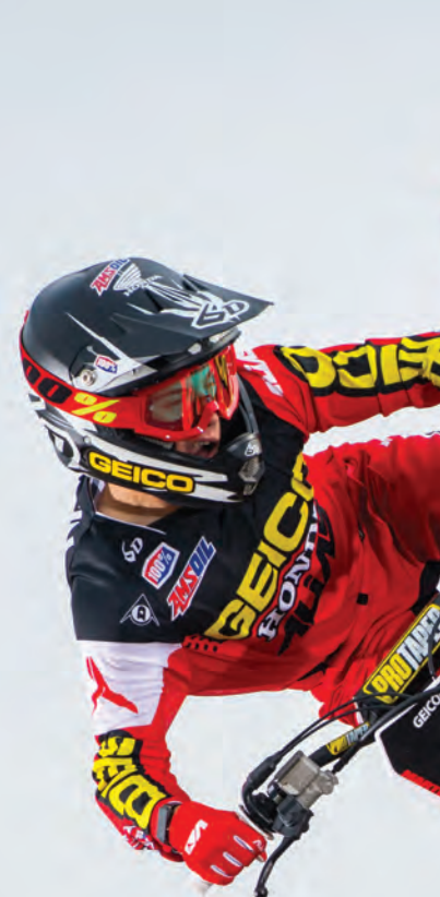
Jeremy Martin GEICO/AMSOIL/Honda