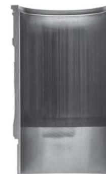
Severely Scuffed Liner