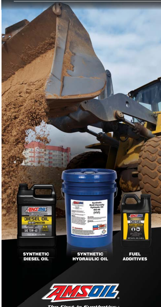
SYNTHETIC DIESEL OIL